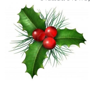
To All A Safe and Healthy New Year